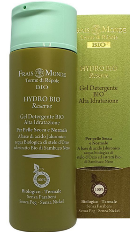
CLEANSING GEL BIO HIGH MOISTURE