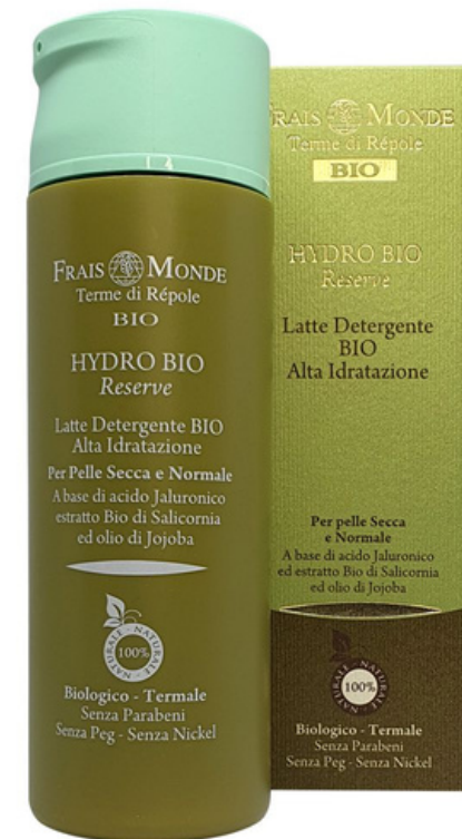
CLEANSING MILK BIO HIGH MOISTURE