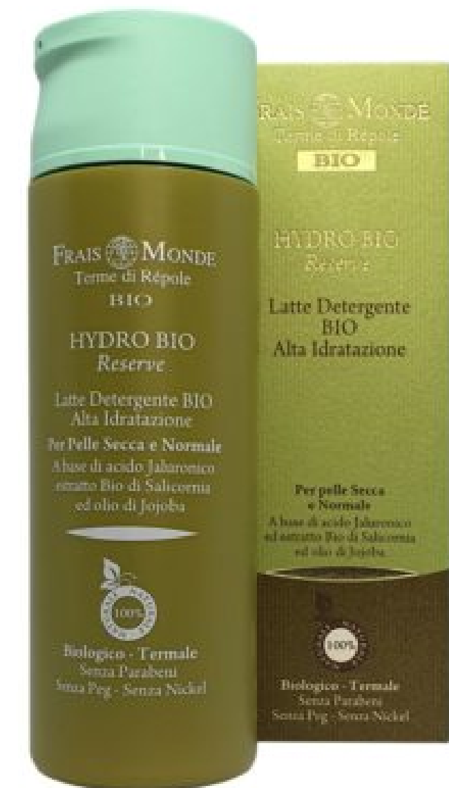
HYDRO BIO RESERVE | FACE