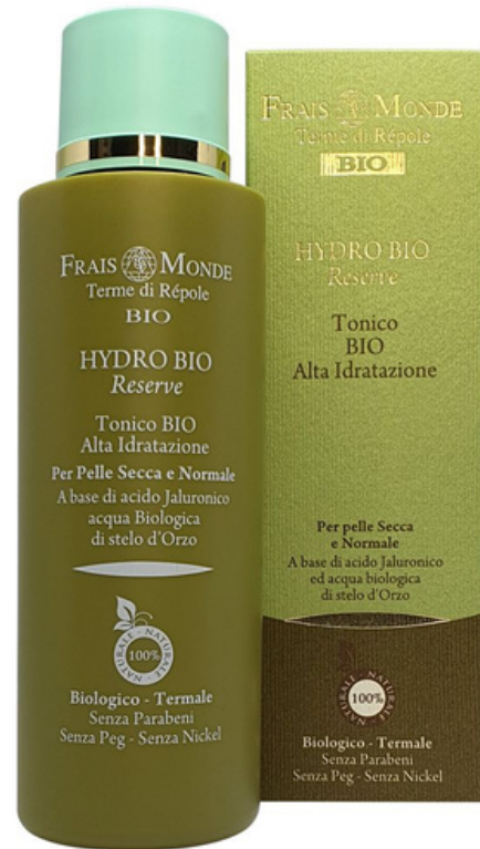
TONIC BIO HIGH MOISTURE