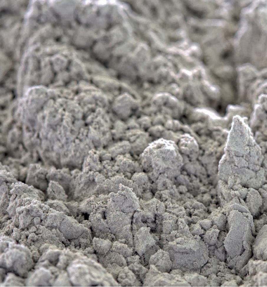
The thermal water in powder

Repole spa salts extracted from our water: The active energy. The heart of the water. The capital is very active.